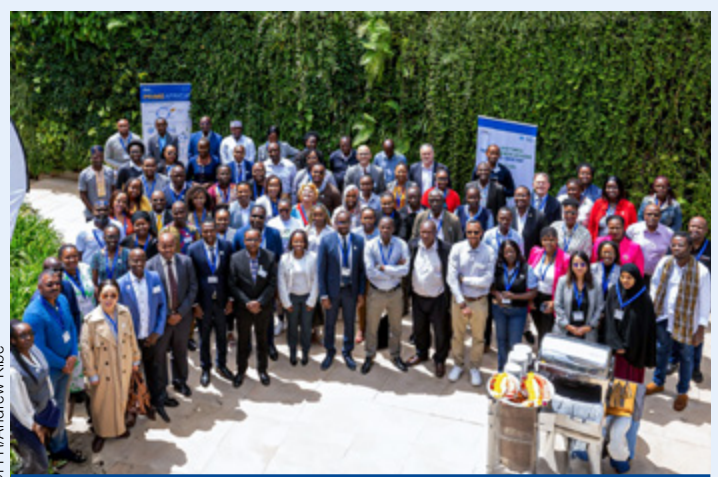
Nairobi, Kenya: IDFR convenes public and private stakeholders, catalysing national action that translates dialogue into market impact.