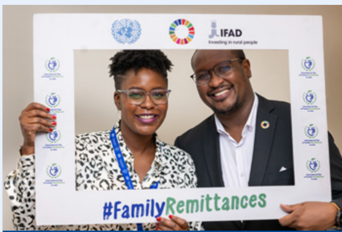
Collective action: The International Day of Family Remittances (IDFR) unites stakeholders to recognize remittance-receiving families and support nearly one billion people.

women living and working outside their country of origin from less developed regions.